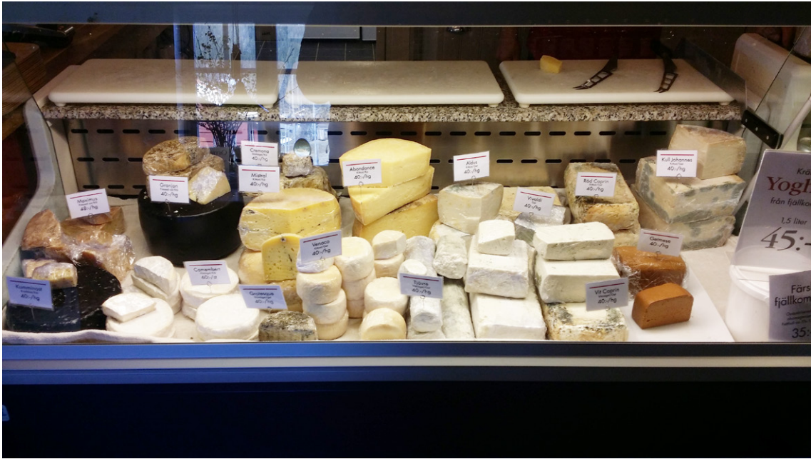
Locally produced varieties of traditional cheese.

The communication on the conditions of small-scale entrepreneurialism in peripheral areas and the entrepreneurs' motivation for engaging in business, and how policy frameworks can support gastronomy and tourism must also increase.