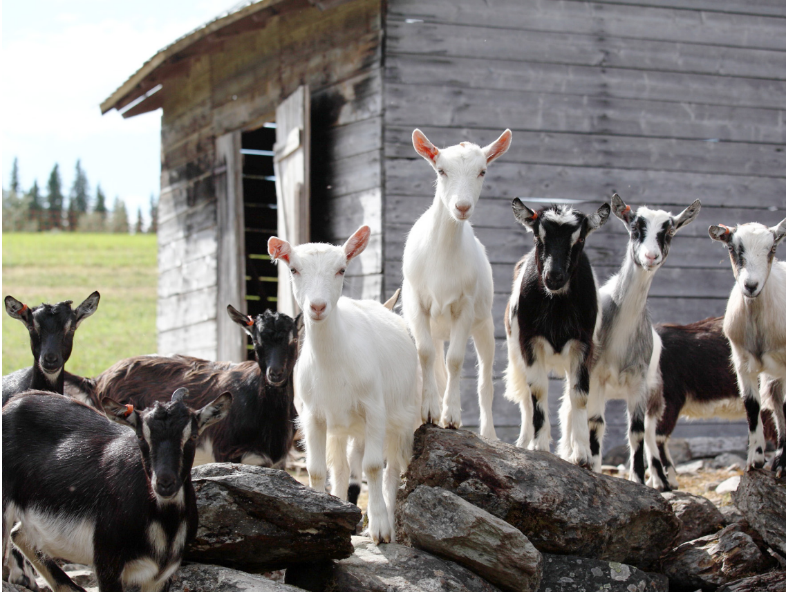
Goats from Skärvången, Sweden.