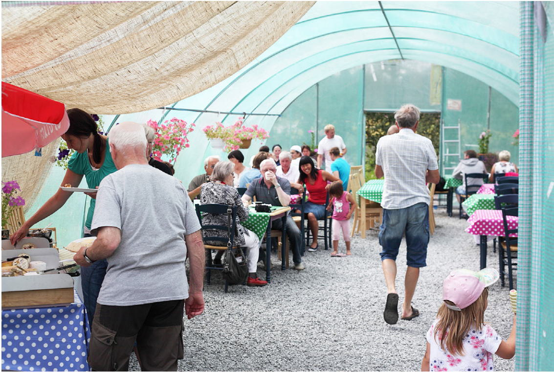
Simple coffeshop at Skärvången, Sweden.