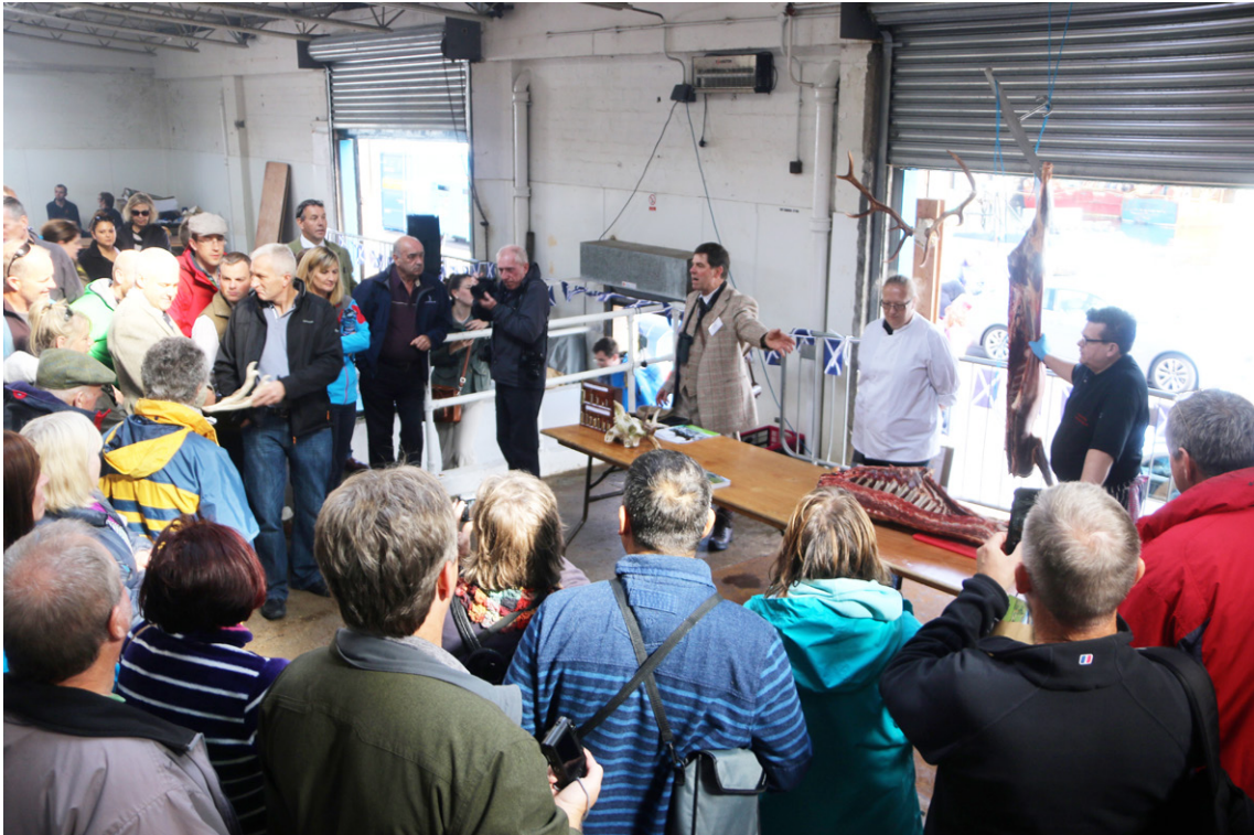
Taste the Wild Food Festival.

west coast is constructed. This example points to the complex ways through which social cohesion is formed and negotiated between the fishing and tourism industries within Mallaig. It is crucial that tourism actors remain aware of such complex social dynamics, so as not to generate distinctions between industry groups.