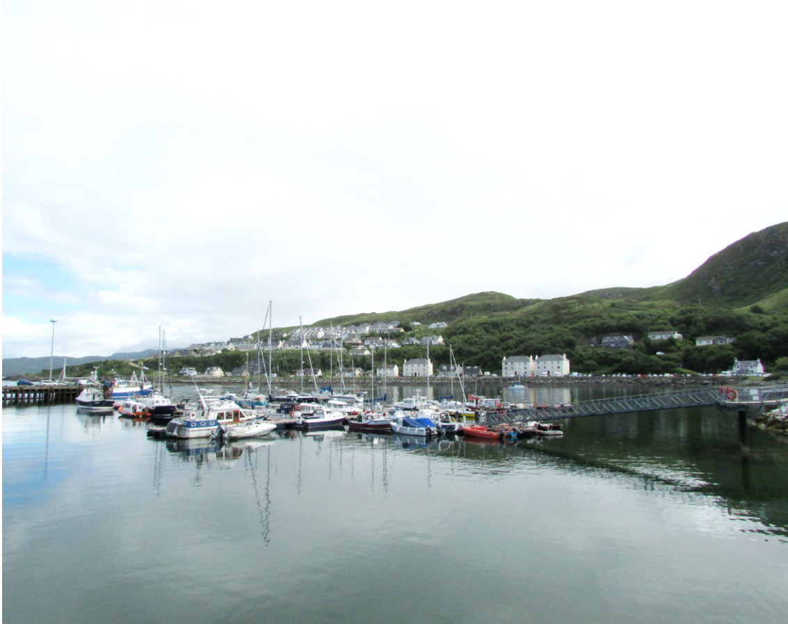
Mallaig Harbour.