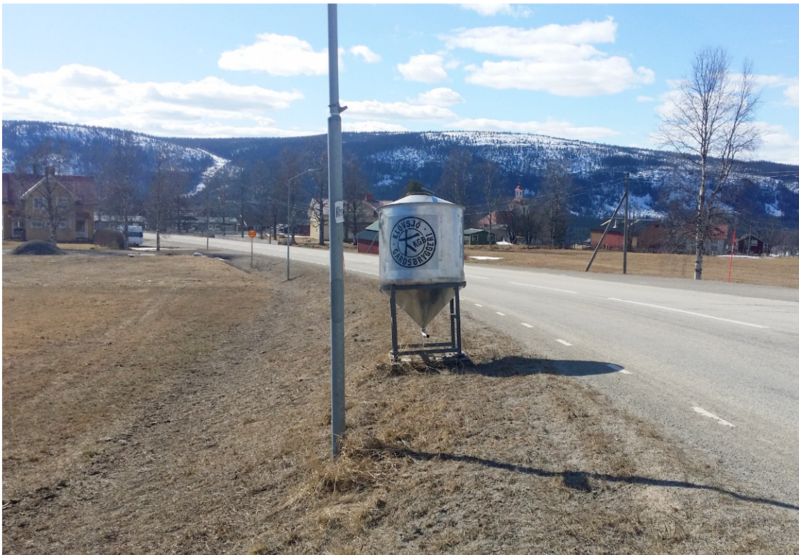
Beer barrel by the highway – entry to craft beer producer.

Jämtland is a geographically large, yet peripheral northern Swedish region that is sparsely populated (127 000). Jämtland has a strong tourism sector and a small scale food production sector that is currently increasing, making it an interesting research context. Located in a mountainous area, the opportunities for alpine skiing, cross-country skiing, ice-sports and other winter activities are very good and attractive to tourists. Its accessible wilderness also provides a popular setting for hiking, fishing, horse-riding, biking and wildlife exploring in the summertime.